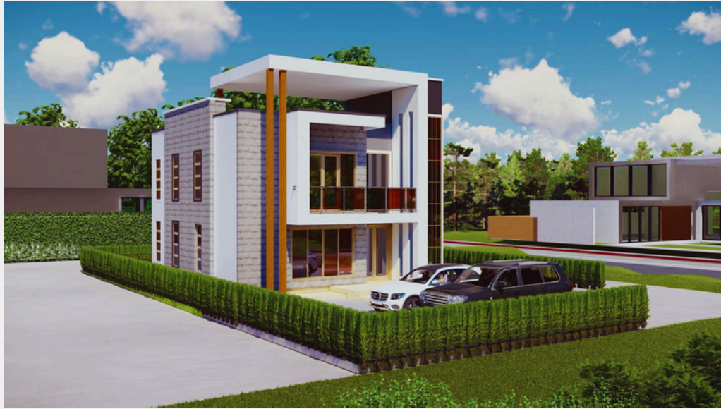
3 Bedroom Flat Roof