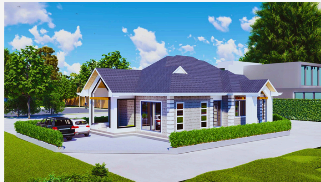
3 Bedroom Bungalow