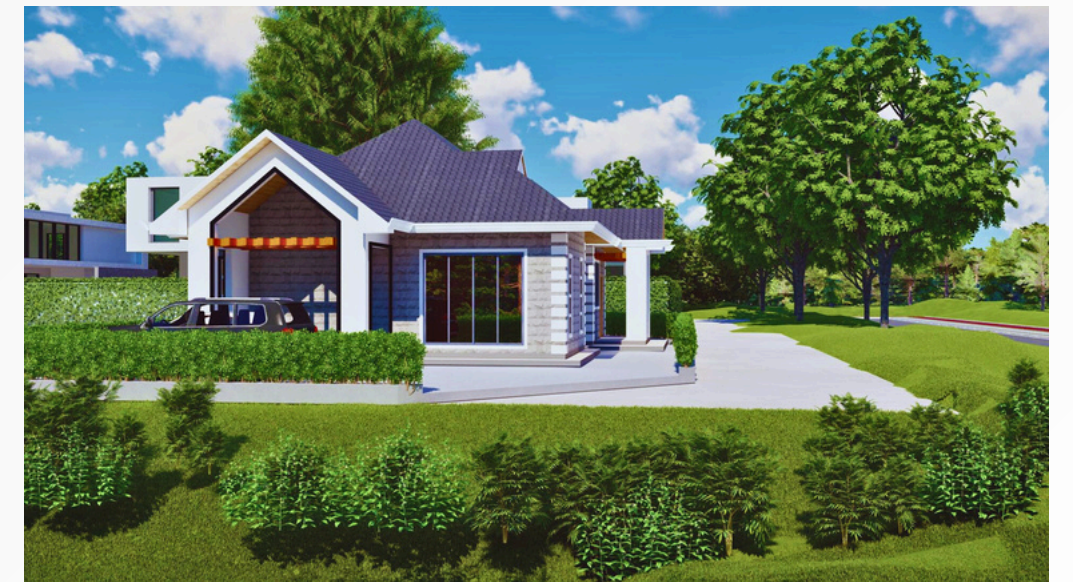
3 Bedroom Bungalow