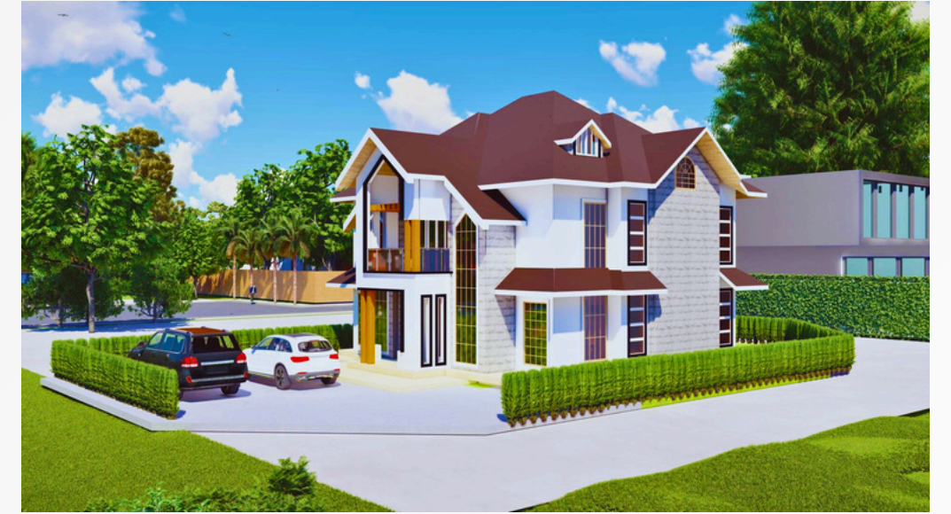
3 Bedroom Pitched Roof