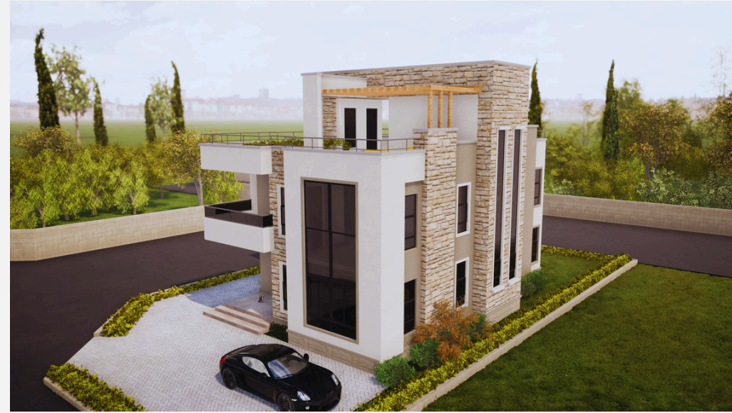
4 Bedroom Flat Roof