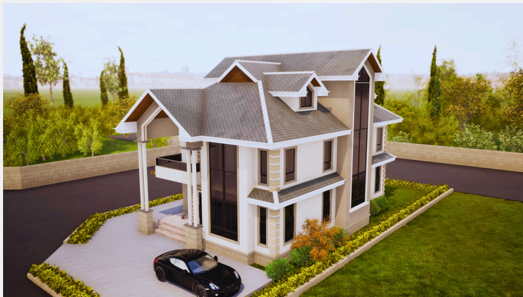
4 Bedroom Pitched Roof